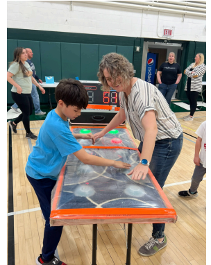
Strike a Light